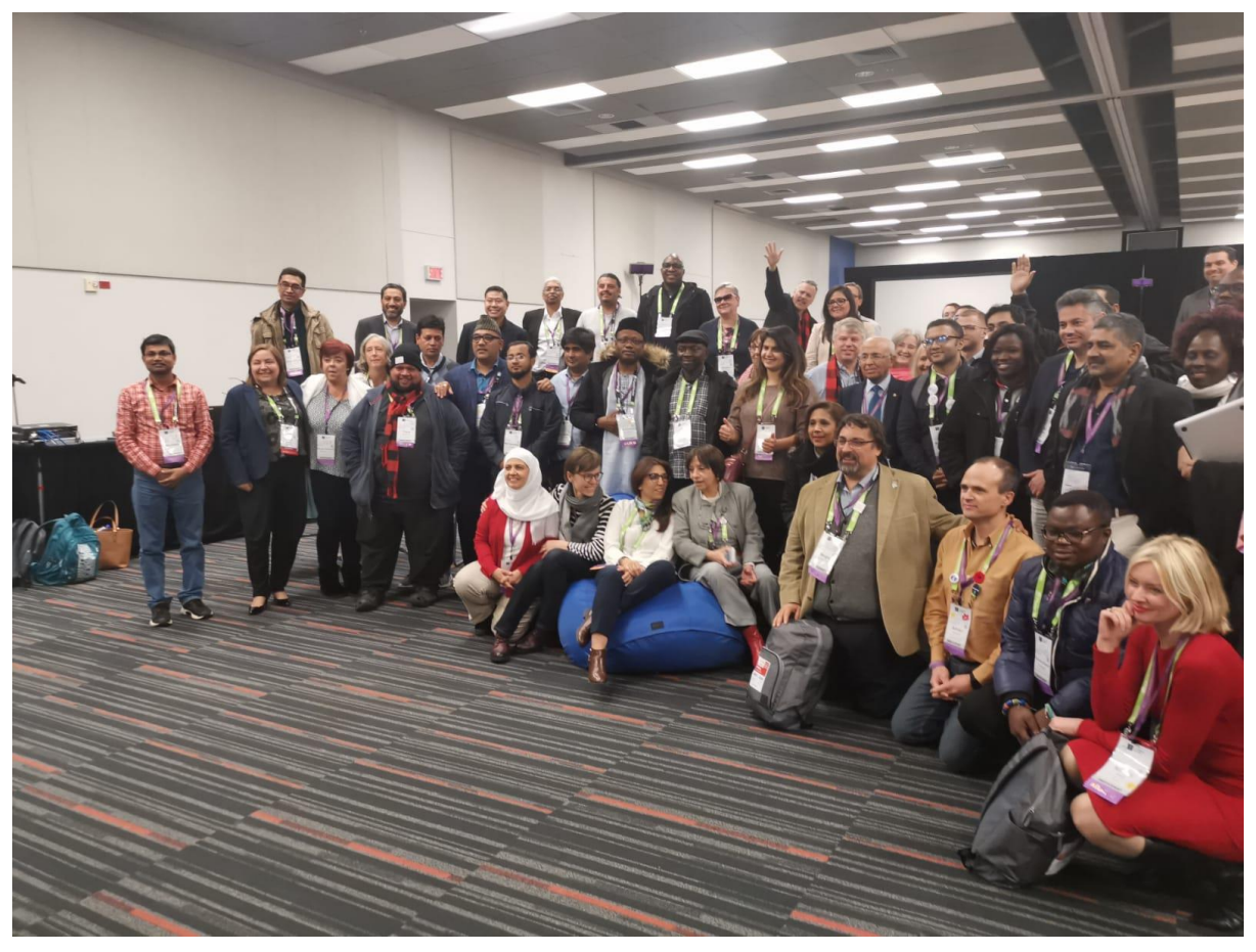
ATLAS III Participants