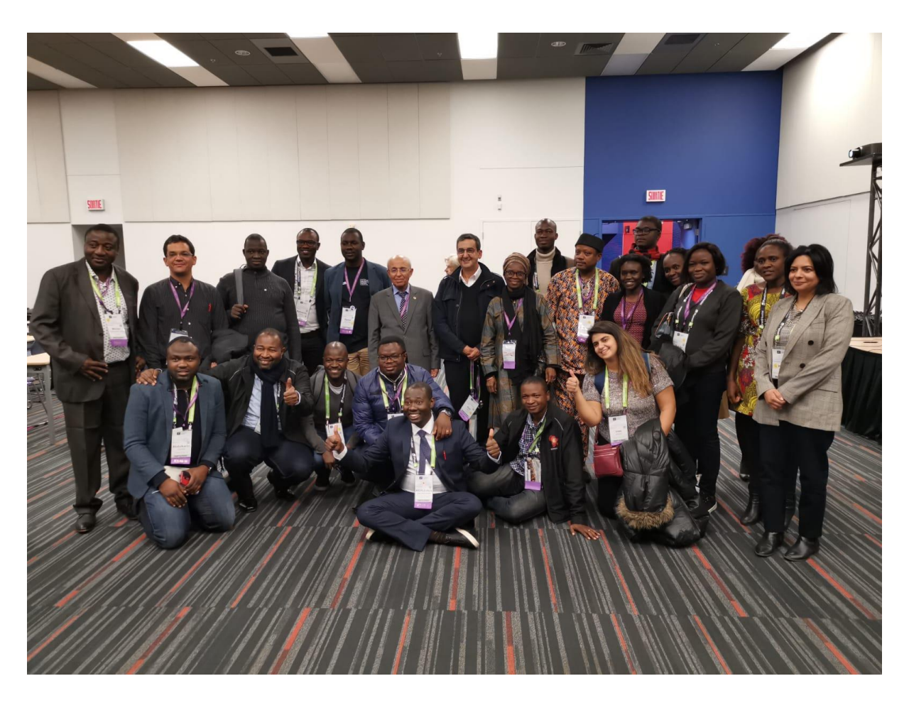
AFRALO Participants at Atlas iii