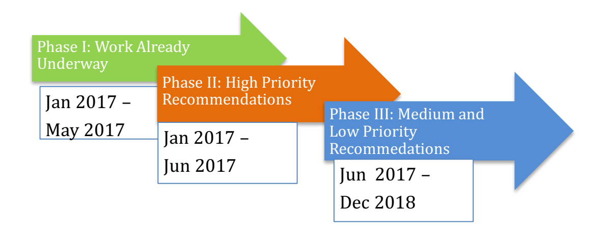
Phase 1: Work Already Underway and Phase 2: High Priority Recommendations

The GNSO Review Working Group suggests that Phase I and Phase II work and mostly run concurrently, while Phase III will not start until the completion of Phase II, due to priorities and dependences. Below are suggested timelines. These will be adjusted as more details become available during implementation.