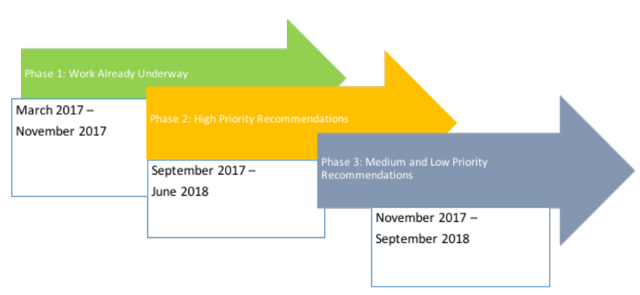
Phase 1: Work Already Underway and Phase 2: High Priority Recommendations

REPORTS TO OEC AND GNSO COUNCIL: ICANN60 28 October – 03 November 2017; ICANN62 25-28 June 2018