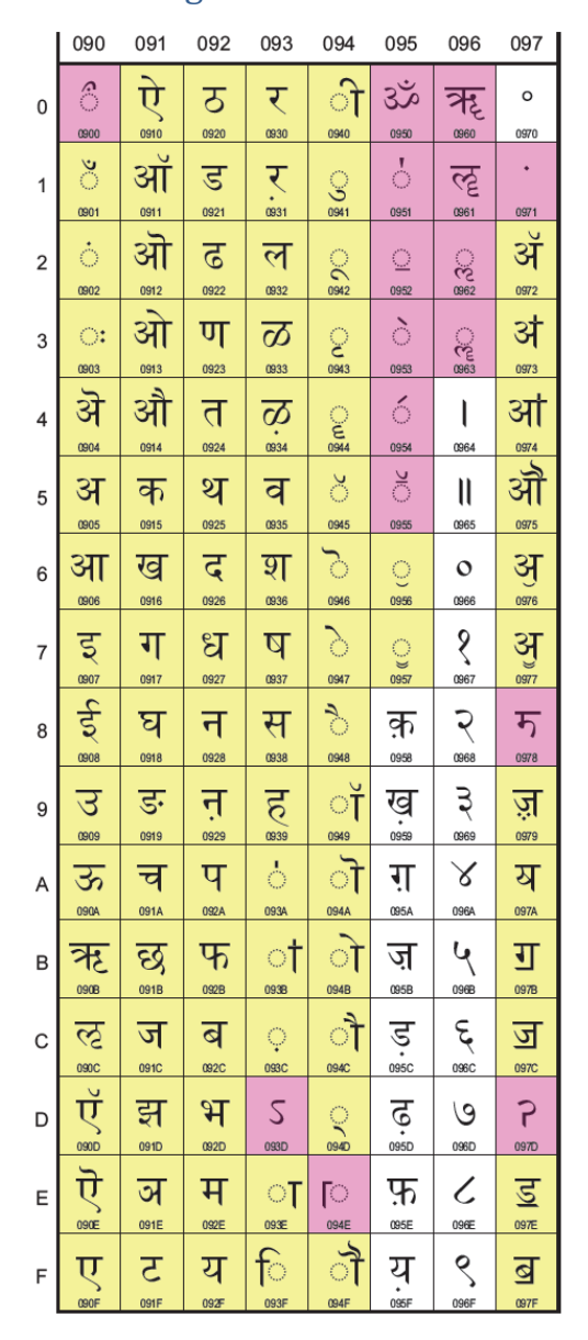
Figure 2:Devanagari Code Page from [MSR]