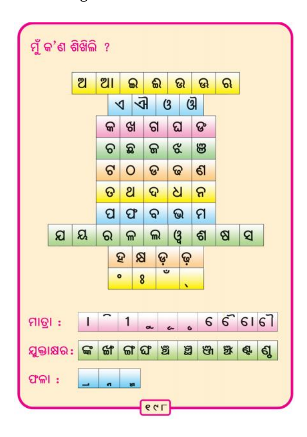
Figure 4: Odisha State Govt. Primary School Grade 1 e-book (Page 112)

Odisha State Government Primary School Grade 1 e-book "HasaKhela" [105] page 112 lists all the Oriya characters as shown in Figure 4.