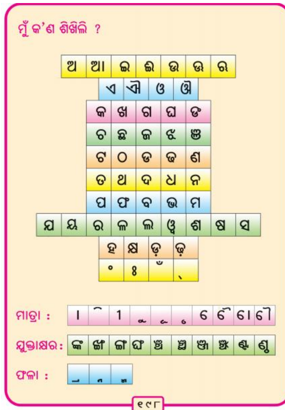
Figure 4: Odisha State Govt. Primary School Grade 1 e-book (Page 112)

Odisha State Government Primary School Grade 1 e-book “HasaKhela” [105] page 112 lists all the Oriya characters as shown in Figure 4.