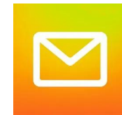
QQ Mailbox (new system)